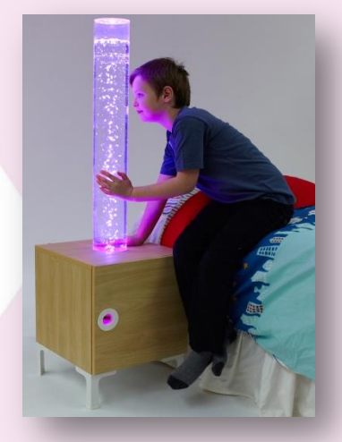
1 x Bedside Cabinet – Bubble Tube (colour and style may vary)