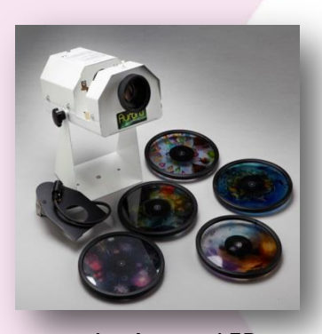
1 x Aurora LED Projector Bundle