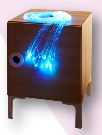
1 x Bedside Cabinet – Fibre Optic Strands (colour and style may vary)