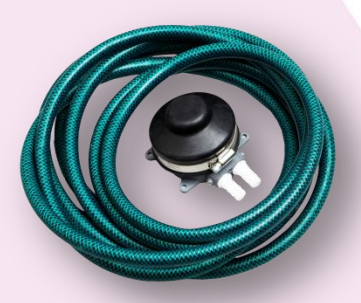
1 x Bubble Tube Emptying Kit with foot pump